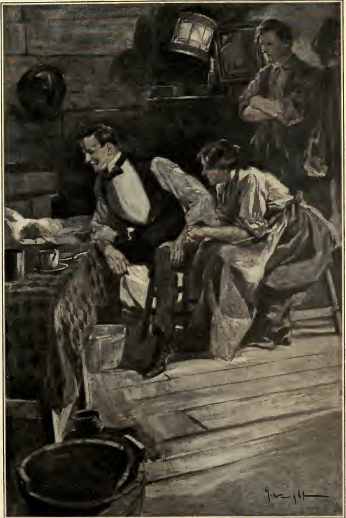
The vigil continued far into the night and until the gray dawn streaked the sky.